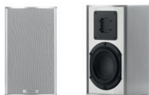
TMicro 40 AMT