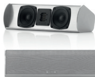
TMicro Center AMT