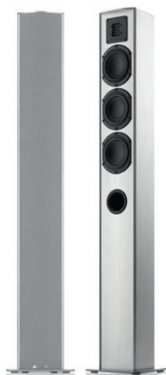
TMicro 60 AMT